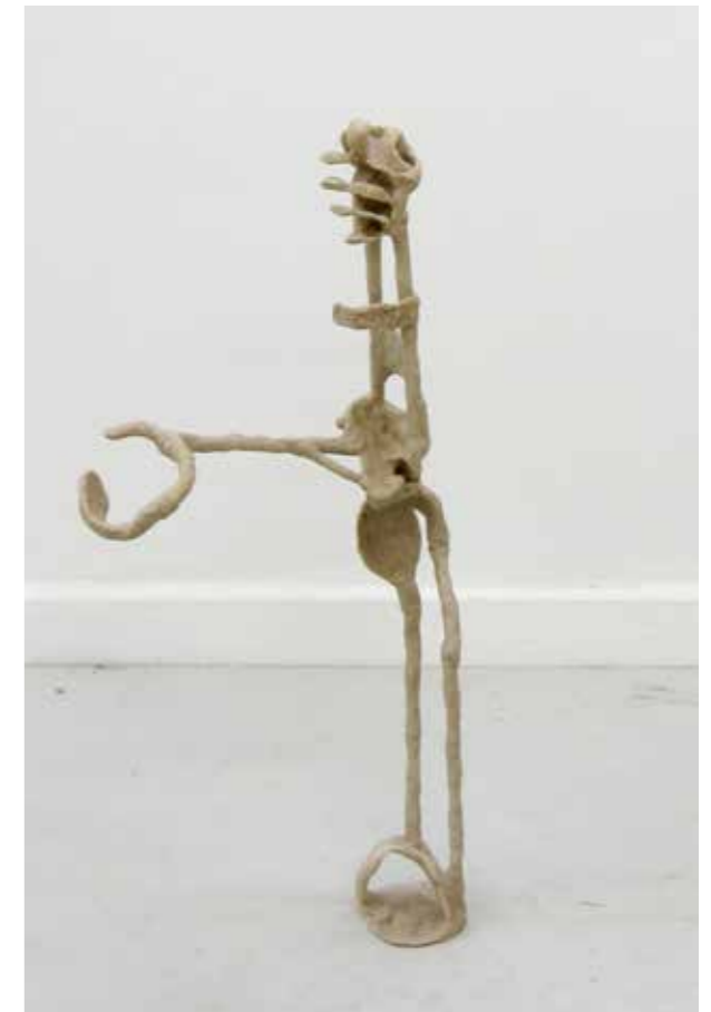
Betrachtungshilfe, 2017 Plastic, Wood 97 x 50 x 17 cm