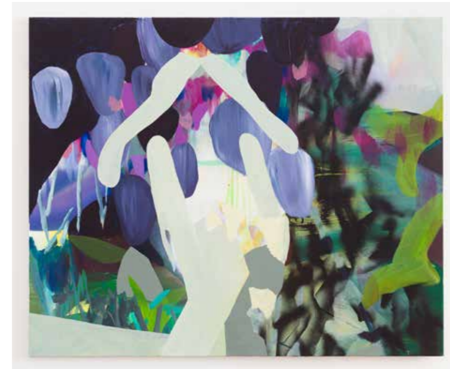
Hoheit, 2019 Acrylic, Spraypaint on Canvas 90 x 110 cm

CI No. The pictures have to go out into the world.