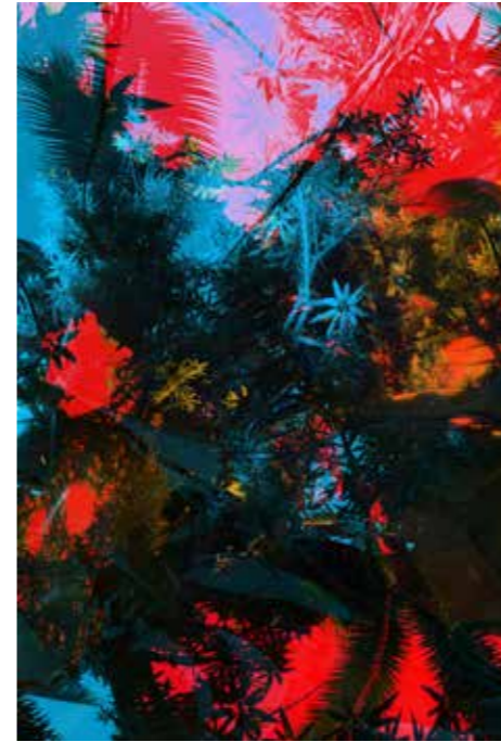
CR_01, 2019 C-Print Diasec 60 x 40 cm Edition of 5+2