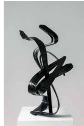
Windows IX, 2016 Corten Steel 160 x 107 x 77 cm