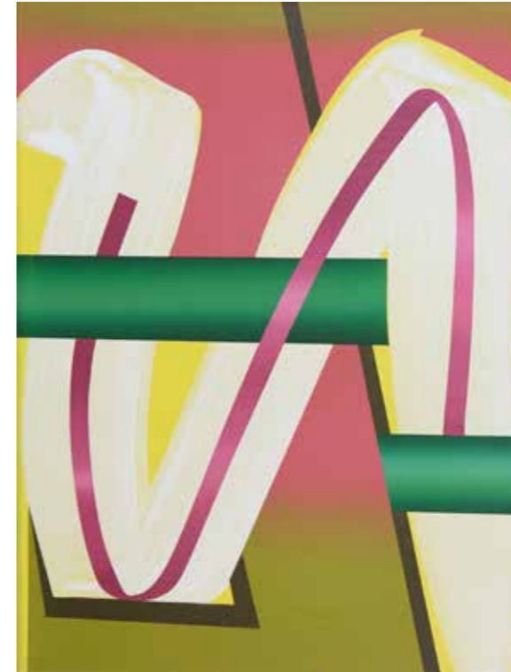
Miami Beach, 2018 Acrylic and Oil on Cotton 40 x30 cm