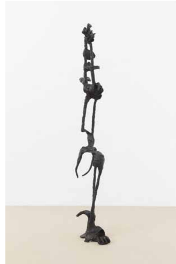
Der Denker eingeschlafen, 2018 Bronze (patinated) 126 x 20 x 30 Edition 2/6