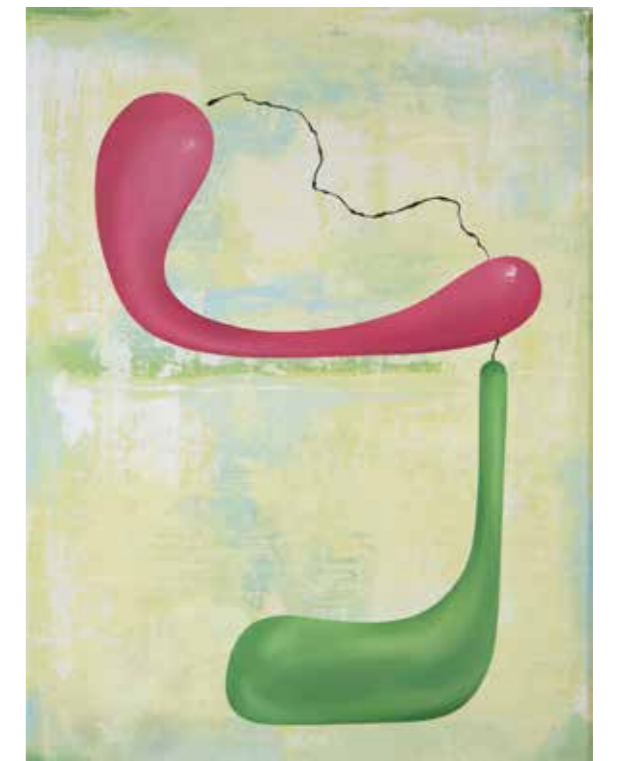
Big Foot's Friend (BFF), 2018 Acrylic and Oil on Canvas 40 x30 cm