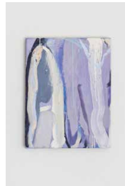
Untitled, 2018 Tempera on Canvas 46 x 36 cm