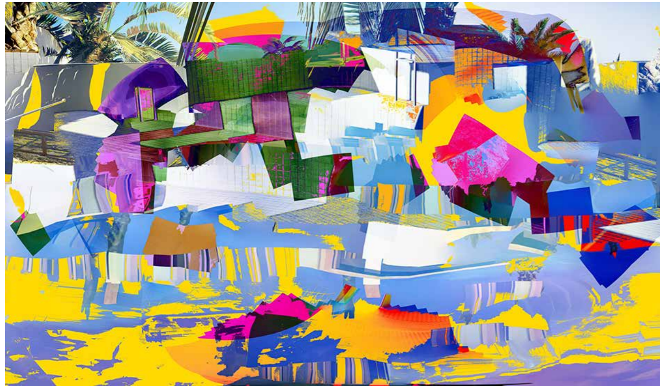
CR_02, 2019 C-Print Diasec 70 x 120 cm Edition of 5+2