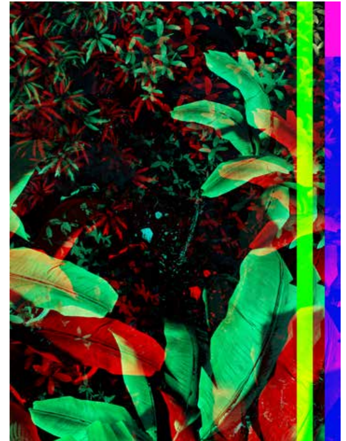
Banana, 2017 C-Print Diasec (framed) 70 x 51 cm Edition of 5+2