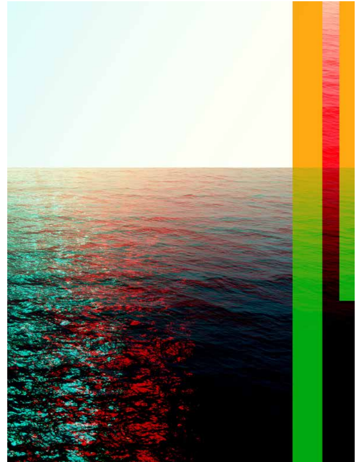
Offshore, 2017 C-Print Diasec (framed) 160 x 120 cm Edition von 5 + 2 A.P.

RB I'm interested in the search. I do not want to be so presumptuous and say: I want to bring photography to the fore. Photography in art is a very flexible term. I find exploring the limits exciting. Of course, software, technology, and data always play a role. And maybe I can expand the boundaries of photography through my continuous search; and maybe I actually did that on a small scale.