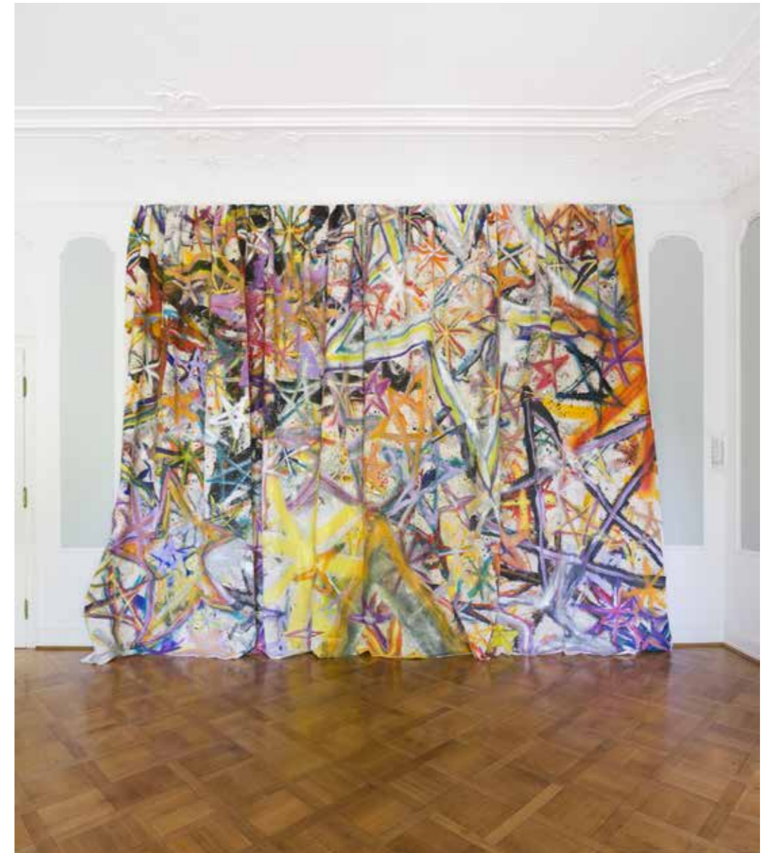
Spacetime Fabric Installation 400 x 700 m (340 x 415 m)

BA The question „what a picture can be“ is the engine of my painting. I want to convey this driving force and provide suggestions. I do not produce propaganda, so I do not want the viewer to agree with my thoughts. I want to work, inspire, share my fascination, prompt and capture the viewers' imagination with what I do. Painting is communication. I communicate with the world. My paintings are manifestations of my reflections and decisions, which document this communication and should initiate discussion independently of myself.