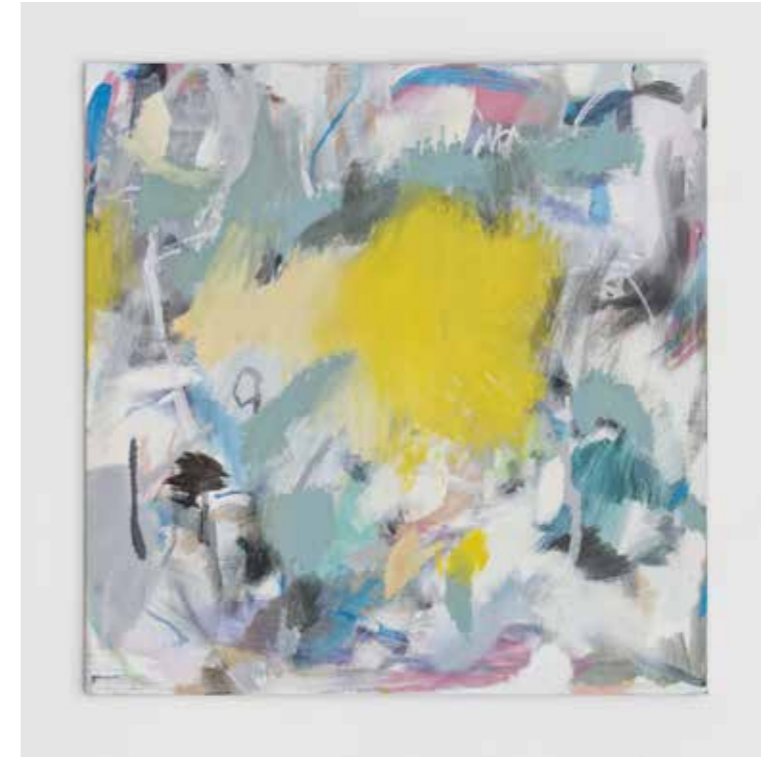
Untitled, 2019 Tempera on Canvas 150 x 150 cm

Of course. The collection is created by exchanging works with friends and colleagues and is not very big. I appreciate it very much.