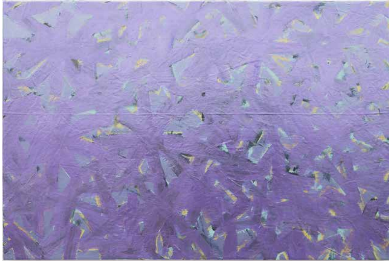
Atacama XIX, 2019 Acrylic on Cotton 120 x 80 cm