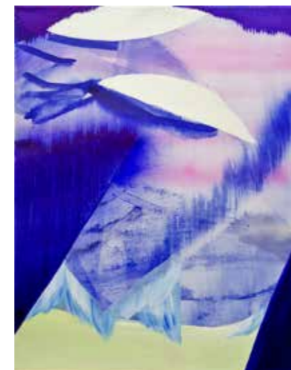
Ryuu, 2017 Acrylic on Canvas 70 x 55 cm