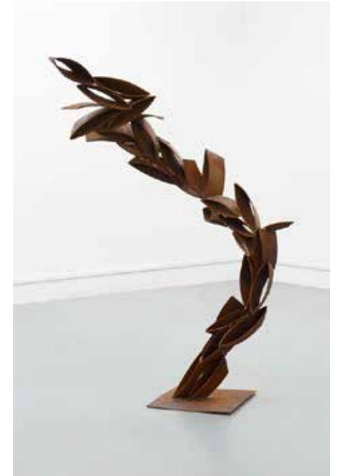
Diversity Impact, 2016 Stainless Steel, powder-coated 180 x 90 x 90 cm