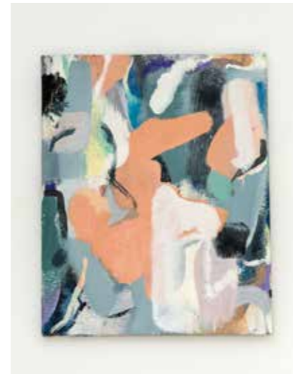
Untitled, 2018 Tempera on Canvas 51 x 41 cm

RPR What drove you to work as an artist?