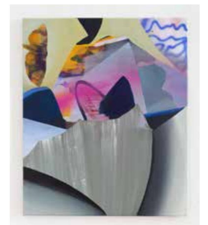
Qué tal el pescado, 2019 Acrylic, Airbrush, Spraypaint on Canvas 60 x 50 cm