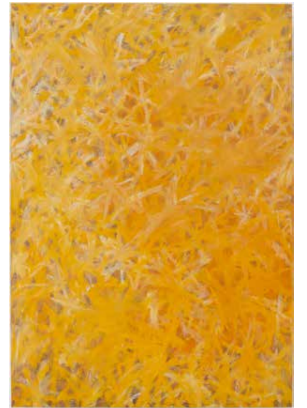
Deepfield XIII, 2019 Acrylic and Oil on Cotton 100 x 70 cm