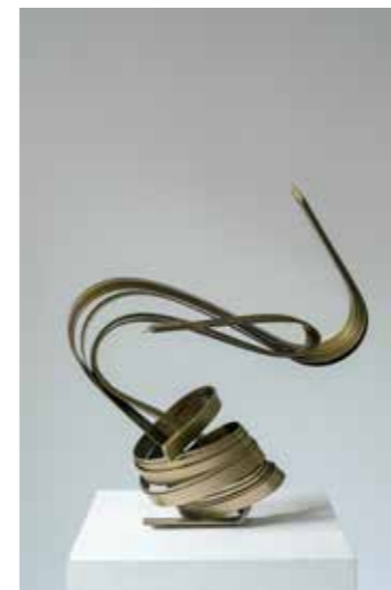
Shapeshifter III, 2017 Stainless Steel, powder-coated 52 x 52 x 20 cm