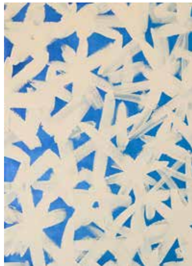
Atacama XX, 2019 Acrylic on Cotton 50 x 70 cm