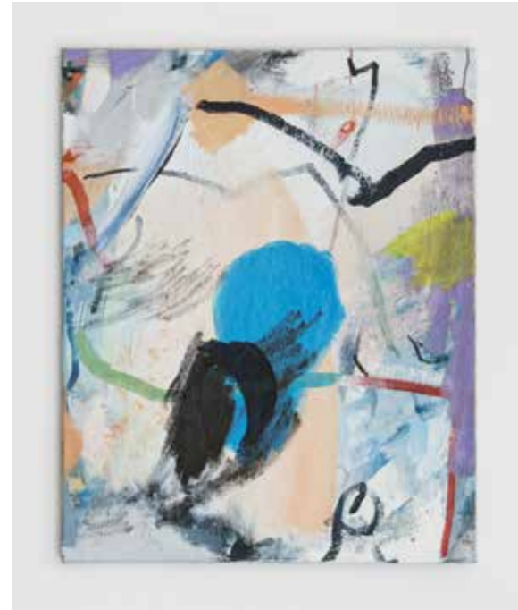
Untitled, 2019 Tempera and Oil on Canvas 80 x 65 cm