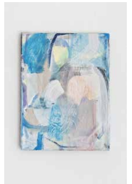
Untitled, 2018 Tempera on Canvas 40 x 30 cm